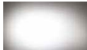
P46WLC-60°H X 20°V Flood