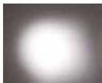
P46FLC-16°H X 16°N Wide Spot