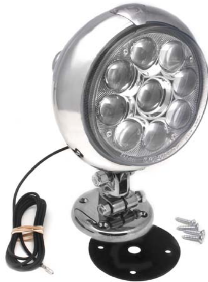
AG 6" Chrome LED Decklight (shown with round bracket)